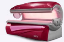
Fancy Red Metallic