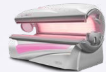
Dream White Metallic